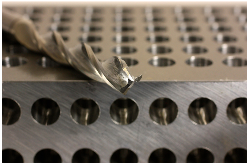
1180 Series High Performance Drill in aluminum