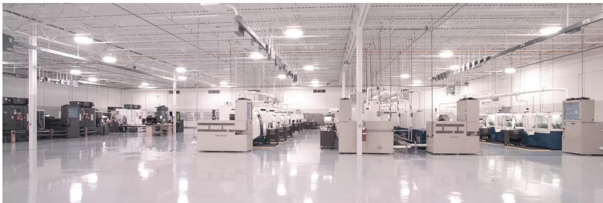
Drill and Reamer Manufacturing