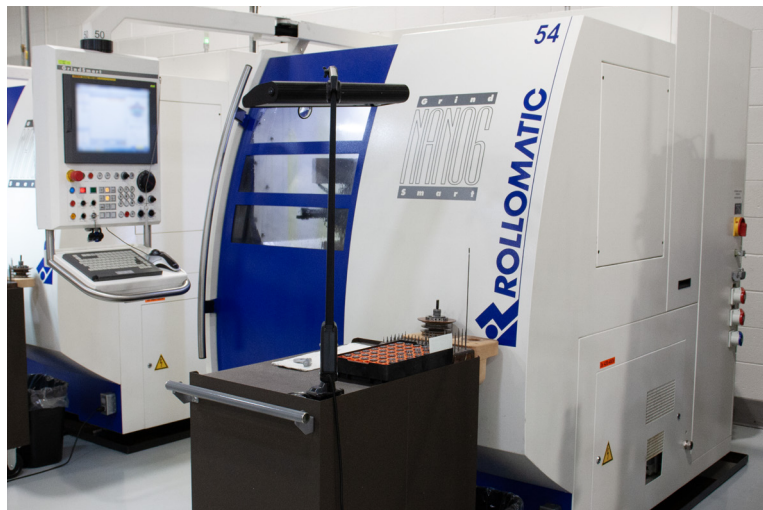
Micro Tool Manufacturing