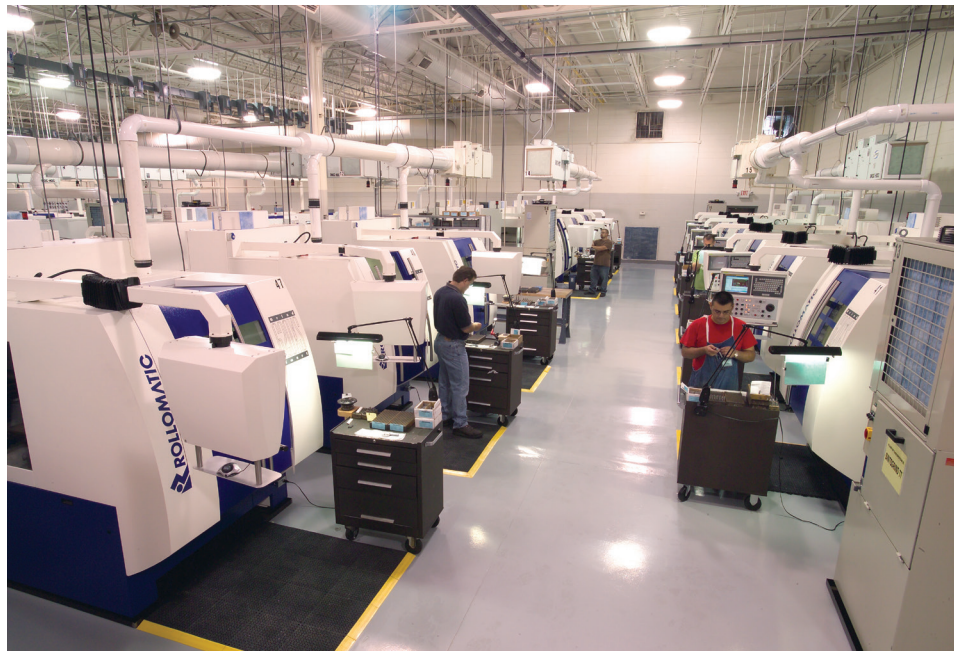
End Mill Manufacturing