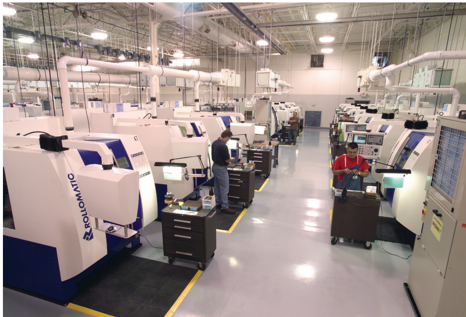
End Mill Manufacturing